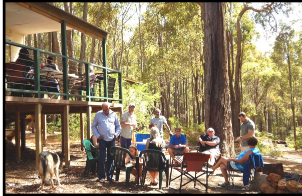
Dee & Garmini's home away from home.

Bit of night fishing for Anjali and few others. Beautiful surroundings but not much caught.