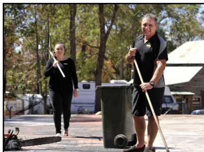
Starting over - owners of Lake Navarino Campsite Waroona . They are standing on the site of the shop, restaurant, bar and office.